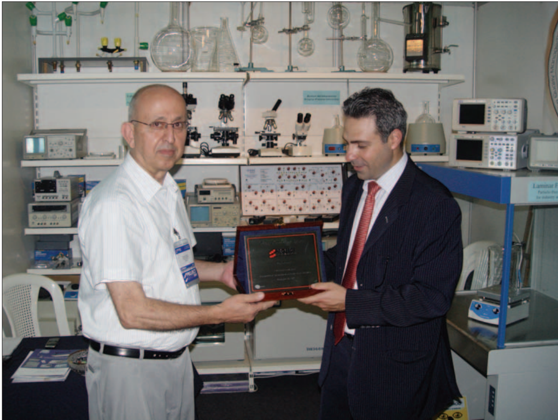
IFP Lebanon, Trade Promotion Award.

Address : Hatem Bldg - Bedran street - Mansourieh - Metn - LEBANON